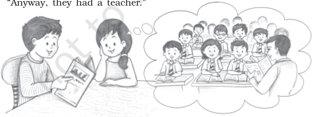
They had a teacher... It was a man.