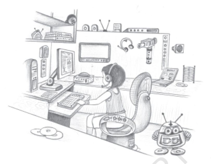
The mechanical teacher was flashing on the screen...

because her mother said little girls learned better if they learned at regular hours.